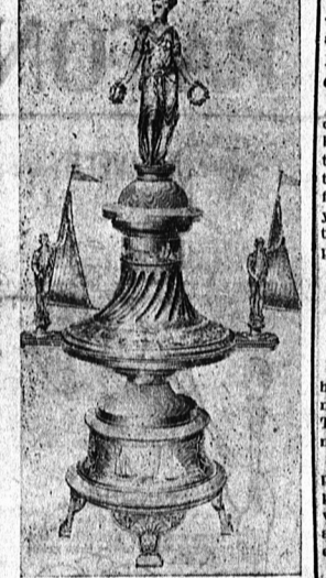
THE H. B. C. CUP Won yesterday by the Micmac.

Limit:—The time limited for yachts will be 4 hours.