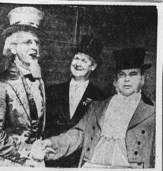
Toronto city hall employees held their own demonstration of U.S.-Canadian good-will, inspired by the American Legion's friendly invasion of Toronto. Pulling up to the city hall steps in an antique chariot, "John Bull" and Uncle Sam" were welcomed by the mayor.