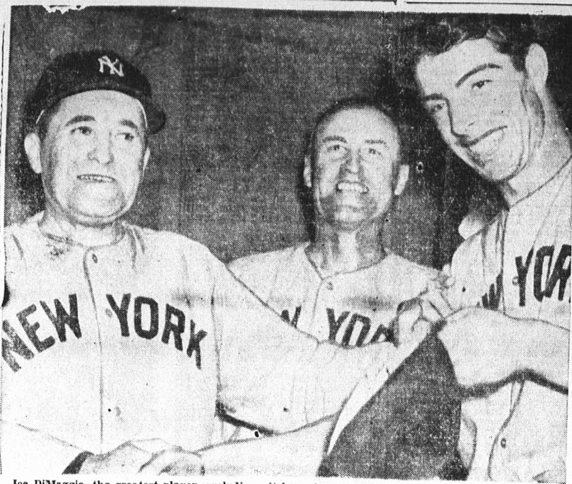
Joe DiMaggio, the greatest player, excluding pitchers, in the present record of baseball, has reached his goal of a new all-time major league record for hitting in 45 consecutive games, and now can try shooting for another prize—the 'triple crown of batting'. This double is the three-way championship in percentage hitting, home runs and runs batted in, and is one of the most elusive batting honors in the game. In the last 15 years it has been won only by the immortal Lou Gehrig, who captured all three in 1934 when he hit .363, collected 49 home runs and batted in 165 triples. At LEFT Manager McCarthy congratulates Joe, and RIGHT, teammates extend a glad hand to the record breaker.