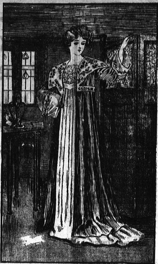
A TEA GOWN OF THE FIRST EMPIRE.

By this Sign you may know and will find Singer Stores Everywhere These Machines are never sold to dealers. Only from Maker to User A small payment down, the rest at convenient intervals. Three different kinds and a wide range of prices to suit. Sold only by Singer Sewing Machine Company Queen Street, Charlottetown, P. E. I.