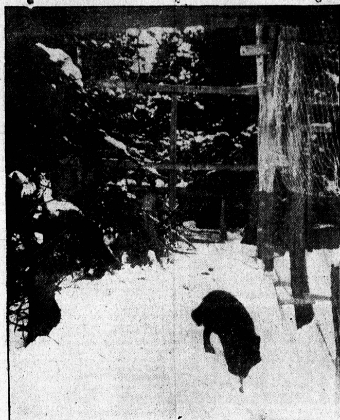
A WINTER SCENE IN A FOX RANCH WITH REYNARD IN THE FOREGROUND.