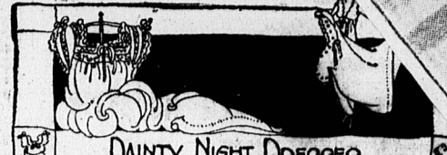
DAINTY NIGHT DRESSES