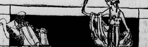
CORSETS & BRASSIERES

CAMISOLES The finest assortment in the city, pink, blue, maize, black, mauve, made of silk, wash satin and crepe de chene short sleeve or sleeveless. Sizes 36 to 44 $1.15 to $3.75.