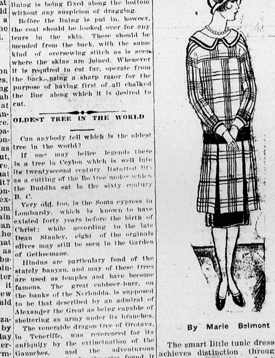
The smart little tunic dress above achieves distinction through its unusual combination of gingham and satin. It is a most effective model and a recent Paris import. The foundation skirt is black satin. The tunic over this is of a smart plaid gingham of fine quality. In reds and blacks and blues. The black satin tunic is repeated in piping on the white organdie collar and cuffs.

The little hat worn with this follows the lead of the frock in using black satin piping on white felt.