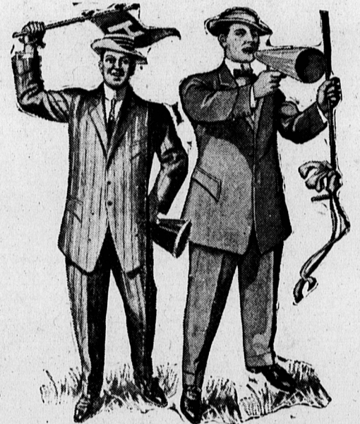
An Overcoat 4 in one. See it Boys

By supplying you with our underwear which is made in a large variety of styles and fabrics, in all waist sizes from 28 to 50 inches and in seams from 28 to 36 inches. We guarantee it will fit and please you. Get a suit it will pay you 1.50 to 2.00 a garment.