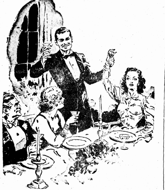
He raised her hand high in the air saying, "She's a jolly good fellow!"

on the table. It was clenched tight. He was afraid she would speak—would say that she had not voiced her opinion. Luckily it was Madison who spoke. "You've all made it hard for me to leave," he said. "And I want to thank you for what Duke calls the demonstration. But there are other things beside believing in majority rule which add up to being a good American. One is to preserve friendly relations with foreign nations. And it just happens Am-lasador Sigora will be waiting for me in New York. I can't let him down." "Of course you can't," agreed