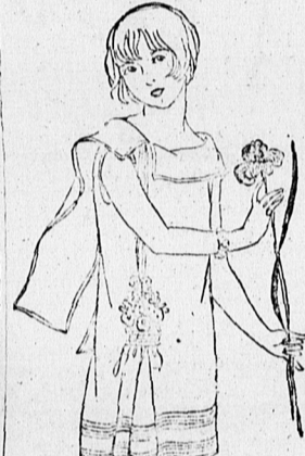
By Marie Belmont.

Crepe in a brilliant buttercup yellow is the smart material used for this gay Summer dress. The model has very much abbreviated sleeves, and the collar extends into the skirt ends which drape at the back. Fine pin tucks in two groups mark the hemline, and the decoration is a group of wild flowers done in wool threads in the various flower colors. While would also be effective made up in this pattern, either white, hatters or white crepe, with colored embroidered flowers for the ornament.