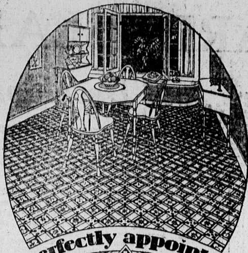
Design illustrates Dominion Inlaid Linoleum No. 7046, available also in one other colouring No. 7045.