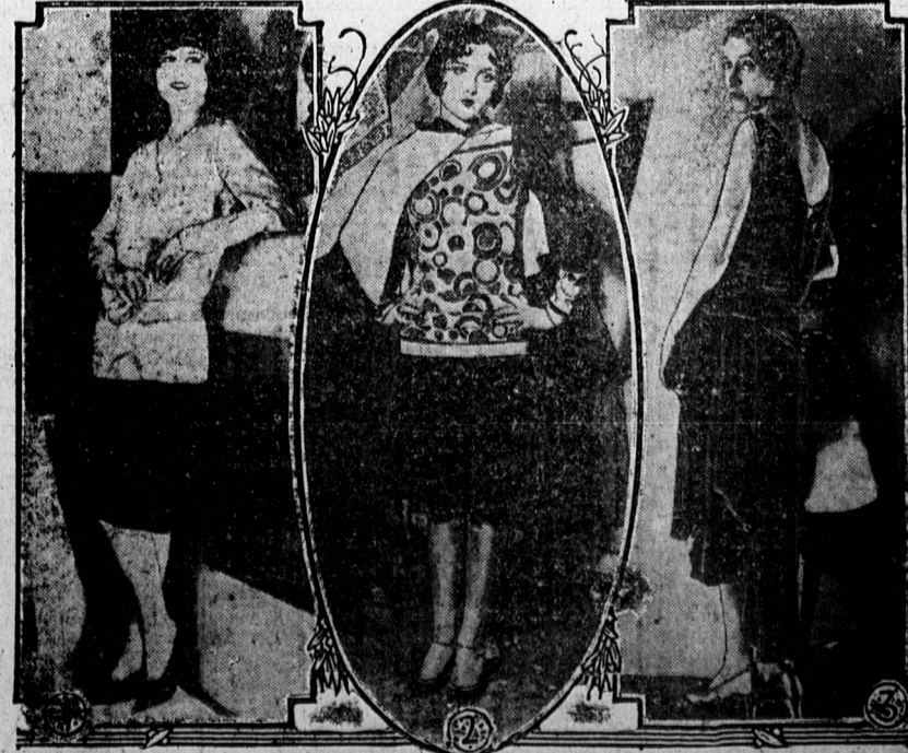
(1) Here is a smart ensemble of black flat crepe with the blouse made crushed closely about the hips with printed transparent velvet with a from an imported scarf. (2) An inter-the skirt shirred on the draped pan-blosure of white satin. It is finished using evening gown of sheer velvet, attached by means of a corded off with a black velvet skirt. (3) A la berry-bege shade. The bodice is shirring.

A gold medalist for Braille reading, she reads everything available in that type and is well acquainted with works so diverse as those of Browning, Shaw and Edgar Wallace. Miss Green is also a capable pianist and telephonist.