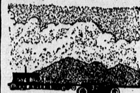
An automobile which drove over the salt fields of Utah.

Once I read a story in which a young teacher went to a ranching district to take care of a school. While riding in a stage coach, she found herself seated beside a rancher and talked with him. The subject of salt came up, and she mentioned the story in the Bible about Lot's wife being turned into a pillar of salt.