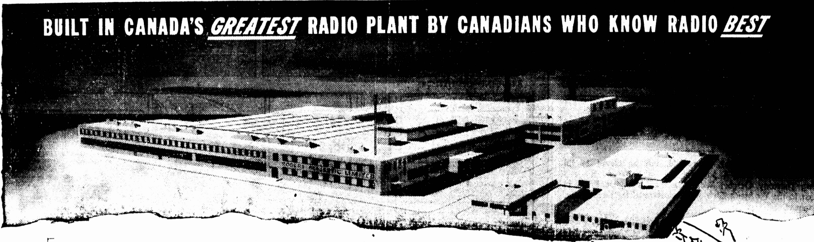
BUILT IN CANADA'S GREATEST RADIO PLANT BY CANADIANS WHO KNOW RADIO BEST