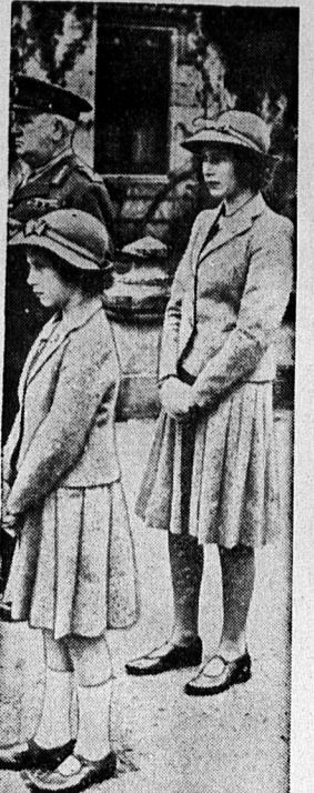
Princess Elizabeth and her sister, Princess Margaret, recently attended an inspection of a Canadian forestry corps made by King George. They are shown at Ballmoral Castle.