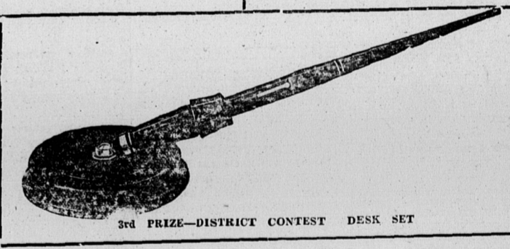
3rd PRIZE—DISTRICT CONTEST DESK SET