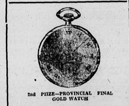
2nd PRIZE—PROVINCIAL FINAL GOLD WATCH