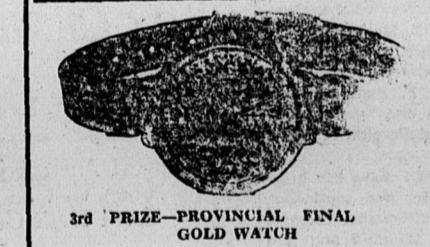
3rd PRIZE—PROVINCIAL FINAL GOLD WATCH

District Contests KINGS COUNTY AT MONTAGUE, IN THE ODD FELLOWS HALL, FRIDAY, APRIL 19, AT 8 P. M.