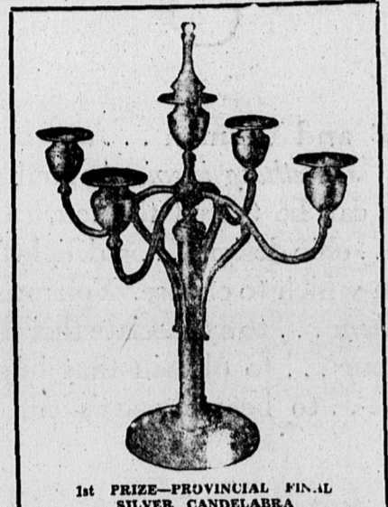
1st PRIZE—PROVINCIAL FINAL SILVER CANDELABRA

The Contests in this Province, which are sponsored by The Charlottetown Guardian will be held on dates given below: