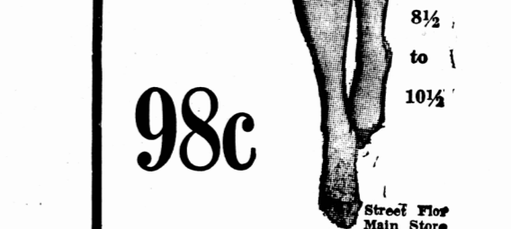
Street Floor Main Store

Shop early Thursday and Friday morning for this outstanding hosiery value --- or phone 400. Lovely sheer nylons in the newest Fall shades.