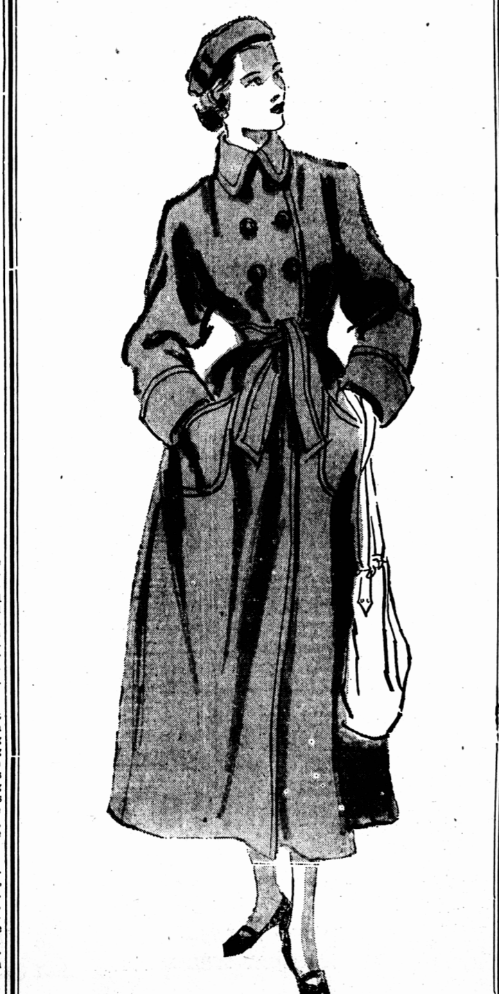
Upper Floor Main Store