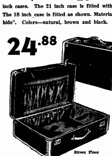
Street Floor Main Store

Matched Baggage Ladies' two-piece "Matched Baggage"—18 inch and 21 inch cases. The 21 inch case is fitted with hangers. The 18 inch case is fitted as shown. Material is "tuff-hide". Colors—natural, brown and black.