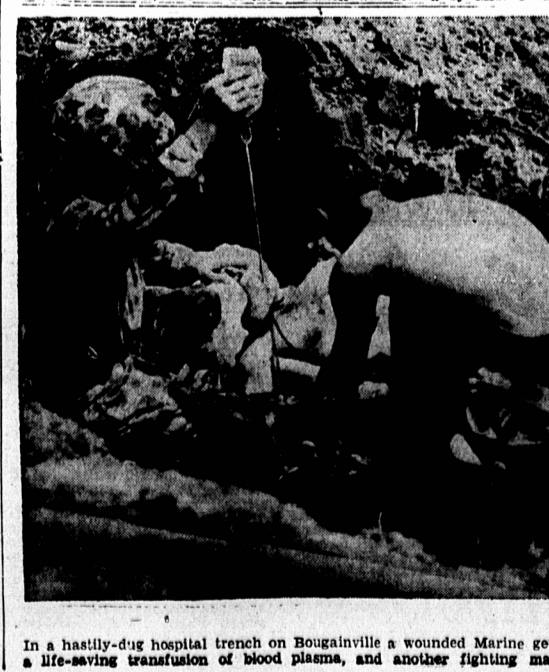
In a hastily-dug hospital trench on Bougainville a wounded Marine gets a life-saving transfusion of blood plasma, and another fighting man