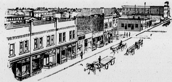
PORTION OF MAIN STREET IN WATROUS.

You may not have purchased in Port Arthur or Port William when lots were selling at such low prices right in the heart of the city, and thereby failed to make the splendid profits that others made, but you have the opportunity today of buying lots in Watrous, right in the heart of the city, at the initial price, and which price is certain to advance rapidly. It seems almost impossible to purchase lots in a live and growing young city of Western Canada and not make splendid and certain profits. Buy lots in Watrous now while they are selling at the ground-floor price, and hold them, and you are certain to make money. The more lots you buy in Watrous the more money you will make. Buy a half dozen or more lots and ride with the wave of advancing values. Ten dollars for every dollar you invest is common in live towns of Western Canada.