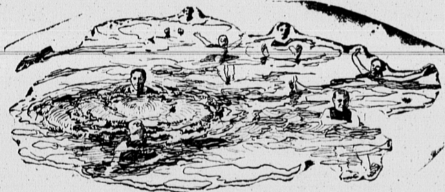
BATHING IN LITTLE MANITOU LAKE

The water is so buoyant that a human being floats on its surface like a fishing cork. Note that some of the bathers are contentedly lying in the water smoking cigars, others floating on the surface with arms folded and feet sticking out of the water. The specific gravity of Little Manitou water is 1.06.