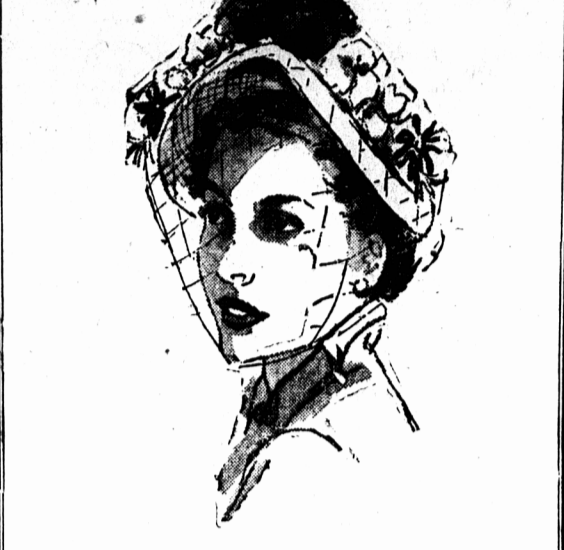
A Reflection of Your Own Good Taste

YOU... in our exclusive, undeniably pretty bonnets... reflect the smartest trends of fashion.