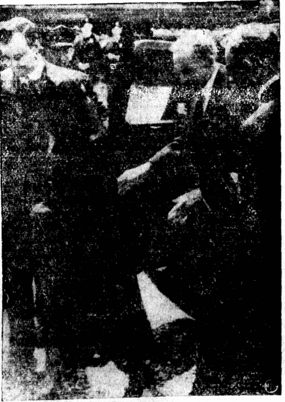
Henry Ford (second from right) and his wife arriving at the Grosse Pointe Christ Church, Detroit, Mich., to attend funeral services for their son, Edsel Ford, late president of the Ford Motor Co.