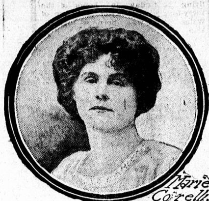
Have Corzella also "Wives with a Bad Streak"

The other pictures are more than good as well. "Tragic Love is the story of the Fallibility of Circumstantial Evidence. Accidents will happen adds a touch of humor to the entertainment, while "Braving Death for the Sake of a Child" is simply as grand as its name indicates. The five choir boys will render their specialty again this evening thus making a program which is beyond doubt one of the very best ever put on at New Wonderland, the "People's Theatre". See it! Five cents admission to all parts of the hall.