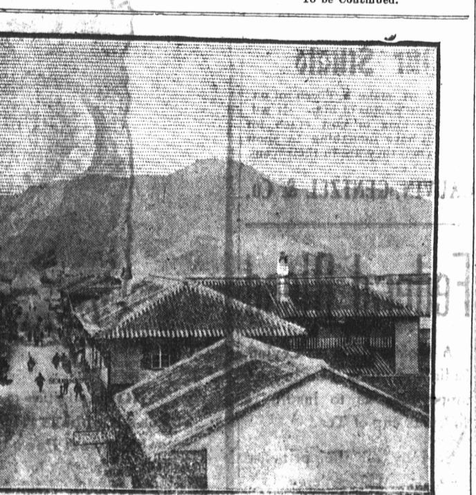
STREET IN NAGASAKI.

that the Russian forces on the upper reaches of the Yalu River consist of small detached parties. ST. PETERSBURG, April 5—(Special).—General Pflug telegraphs from Mukden under Monday's date denying the report of Japanese operations in Manchuria and stating there are no Japanese troops there. ALL QUIET AT PORT ARTHUR. PORT ARTHUR, April 5—(Special).—There are no signs of the Japanese fleet and no notable change in the situation.