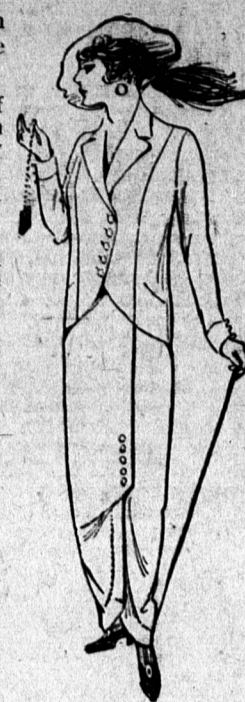
Sketch of a Prowse Suit

Particularly full variety of New Suits for $15, $18 and $20.