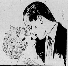
Tom: I love you, dearest one. Tess: Have you seen papa? Tom: Yes, little one. I saw him last night at the poker party. That is how I got enough money to propose to you.