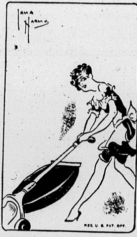
"A vacuum cleaner often takes a little nap while running."