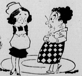
New Maid: Mrs. G. Ossip called while you were out ma'am. Mrs. Telite Wright: Thank goodness, I was out. New Maid: That's just what she said, ma'am.

BASE BALL Baseball players use Minard's for stiffness, strained ligaments and bruises. They also recommend it as a rubdown.