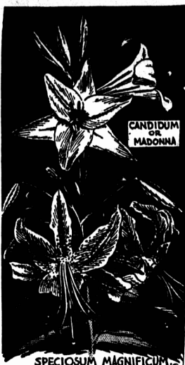
Beautiful Speciosum Lilies, Formerly Imported from Japan, Now Come from Holland

Thanks to increased production in this country, and to European growers, the variety of lilies available this fall is increased, though still far from complete. Madonna lilies are again being imported from France; but if these are planted it should be remembered that they must go in early enough to make top growth this fall, if flowers are to be produced in the spring. If the ground freezes too soon after planting, flowers will fall.