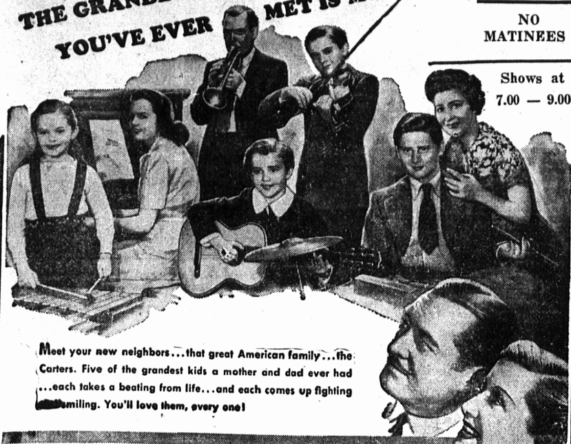
Meet your new neighbors... that great American family... the Carters. Five of the grandest kids a mother and dad ever had... each takes a beating from life... and each comes up fighting smiling. You'll love them, every one!

THE GRANDEST FAMILY YOU'VE EVER MET IS MOVING TO TOWN!