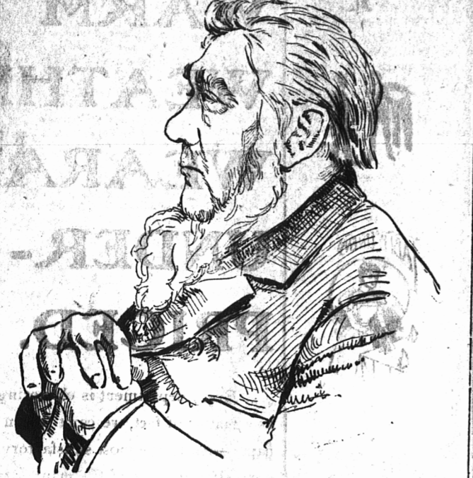
OOM PAUL KRUGER.

CLAVNES, Switzerland, July 14.—Paul Kruger, the former President of the Transvaal Republic died at three o'clock this morning from pneumonia and supervening of the heart. He lost consciousness on Monday.