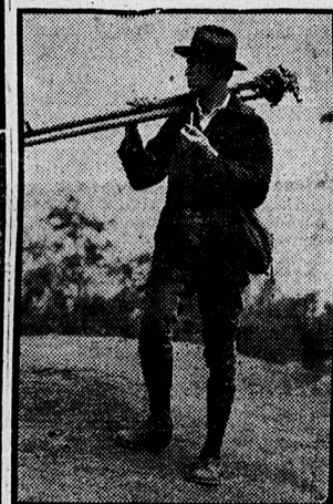
On big jobs a man must keep fit