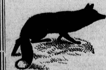
"Orb" Brand Fox Netting

English Manufacture, heavily galvanized before and after being woven. Used by all the leading Ranches on P.E.I. The Netting with reputation. Large Stock Prompt Shipment. Lowest Prices. Write THE ROGERS HARDWARE CO., Ltd. CHARLOTTETOWN, P.E.I.