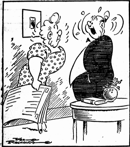
"I don't care if a Guardian Want Ad does offer a $5 reward—I ain't going out and hunt for an escaped lion!"