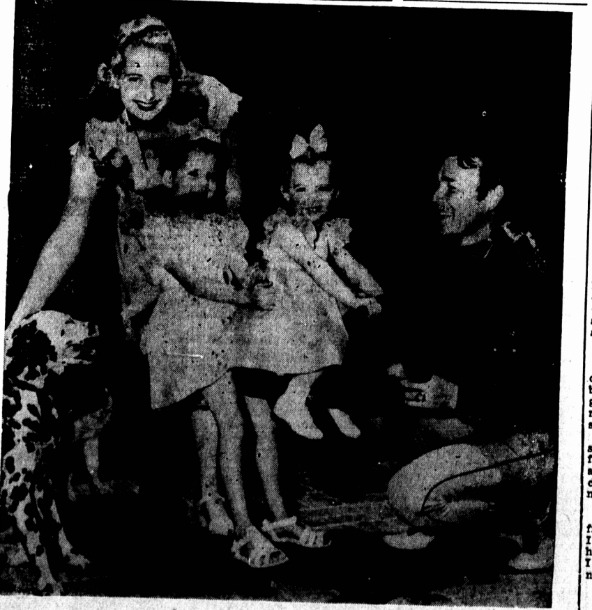
Happy a few days ago over the birth of his first son, Roy Rogers today mourns the death of his wife, Ariene Rogers, seen with the cowboy star and their children. In hospital at Hollywood, Mrs. Rogers died of a blood clot following a caesarean operation.

ANSWER: My advice to you is to can your romance and stick to your good wife and little daughter. You will be happier living with a clean, faithful woman who has been true to you than you will be if you start out to be a wolf who pursues every skirt that flutters across your path.