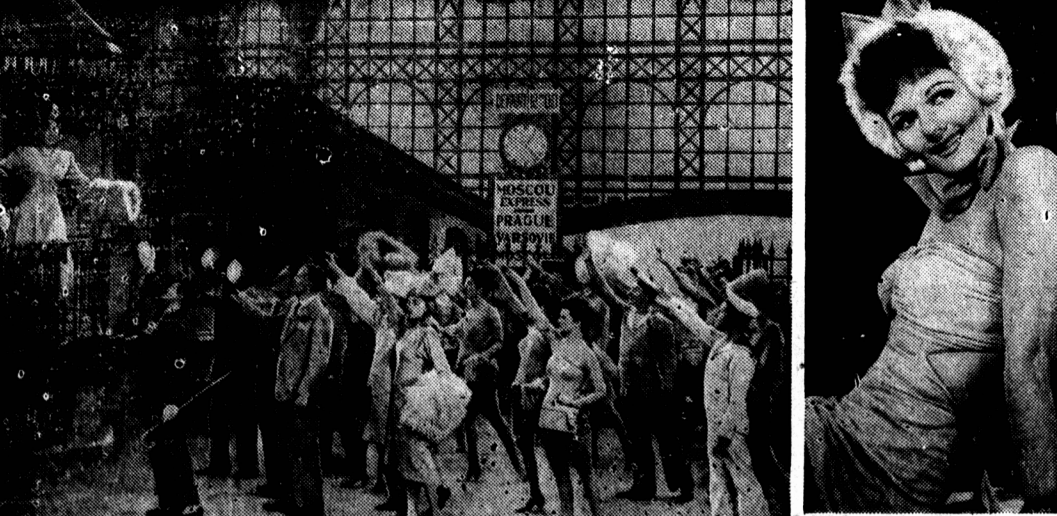
"Night and Day," Warner Bros. Technicolor musical extravaganza based upon the career of composer Cole Porter, sums up the twenty years of development in talking motion pictures since Warner Bros. first introduced sound in 1926. In this scene from the production, Ginny Simms is setting a grand sendoff from a host of admirers.