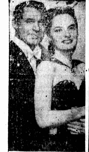
Romantic Pair—Gary Grant and Alexis Smith play the leading romantic roles in "Night and Day," Warner Bros.' extravagant musical film based upon the fabulous career of Cole Porter.