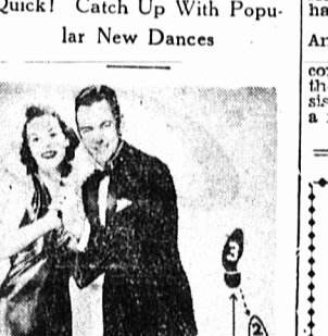
Learn the Conga at Home

The Conga is riding the crest of the wave. In the smartest spots you hear the rattling rhythm of this Cuban dance.