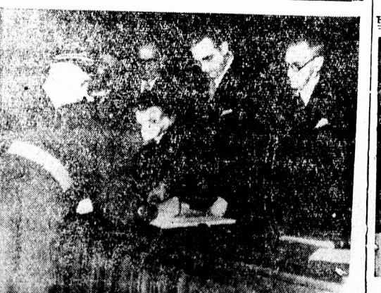
Recently the Burgomaster of Ghent invested members of the Canadian forces with the "Medal of Honour of the City". Here Maj.-Gen. D. C. Spry, Toronto, signs the city guest book just prior to the ceremony.