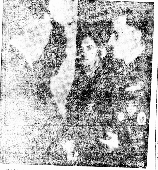
Said to be the last picture taken of the Fuehrer before his mysterious death. The caption accompanying this photo on September 29, reads: "Adolf Hitler, German Führer, is seen with his headquarter commander of the Belgian Resistance, who was awarded the Knight's Cross to the Iron Cross."