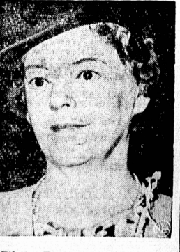
Ethel Barrymore, above, 65-year-old actress, is being treated with penicillin in a New York hospital after she was stricken with influenza and was forced to miss her first stage performance in 50 years.