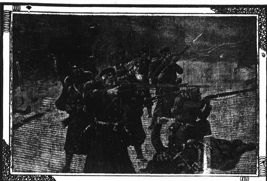
JAPANESE SKIRMISHERS BEFORE NANSHAN HILL.