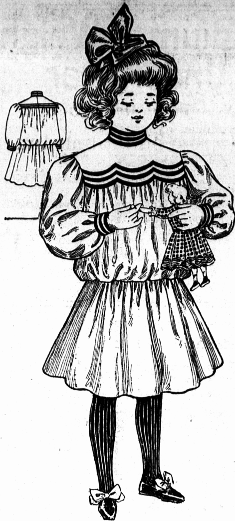
A FRENCH BLOUSE FROCK.

Will not the volumes of letters from women made strong by Lydia E. Pinkham's Vegetable Compound convince all women of its virtues? Surely you cannot wish to remain sick and weak and discouraged, exhausted each day, when you can be as easily cured as other women.