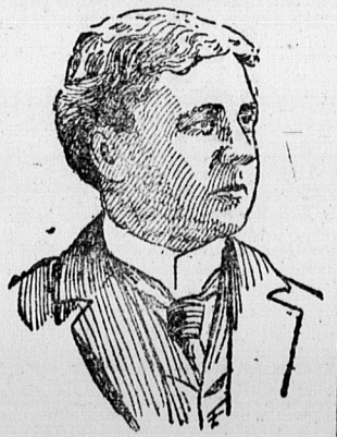
PREMIER M'BRIDE OF N.S.