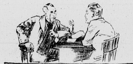
It safeguards your income—

Canada Life Assurance Company, Toronto: Dear Sirs—Without obligation on my part, please send me particulars at Name Address Born day of 53-L.