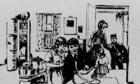
guarantees $5,000 to your family.