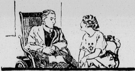
—if you become permanently disabled—