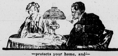
protects your home, and—