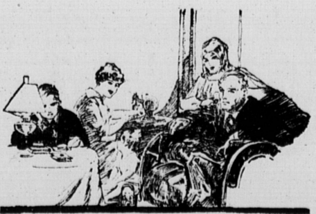
—pays you $50 a month for life, and