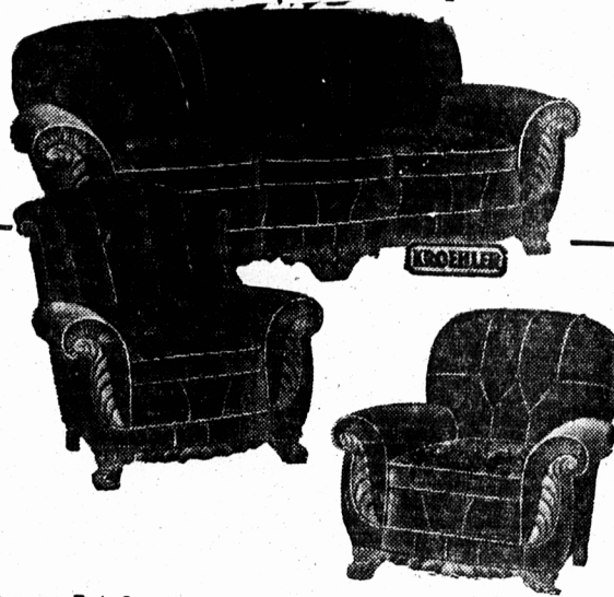
Wonderful Savings In CHESTERFIELD SUITES