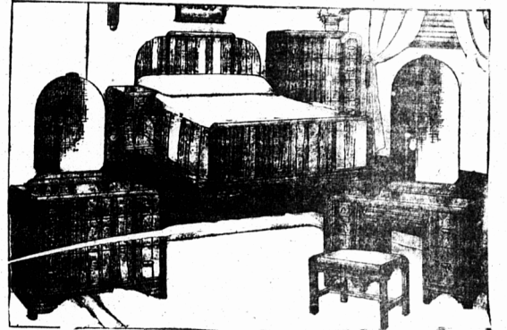
Save Dollars On Your New BEDROOM SUITE!

Also A Few Odd Chairs, Tables, Lamps, Etc. Included