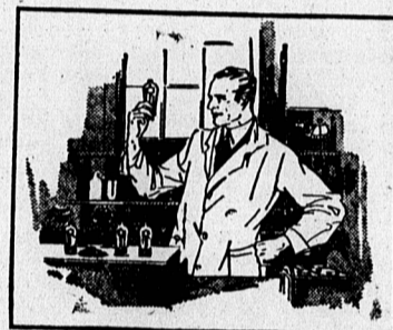
Quite as involved as the manufacture of radio itself is radio tube development and production. Laboratories, constant research, electrical theories, gases, chemicals! Voltages, heat resistances, filaments, hundreds of tiny parts! All concentrated into making a small glass bulb with bits of wire and metal inside. The miracle of a radio tube!

The Tubes in this Radio are Guaranteed! ROGERS Guaranteed Tubes at NO EXTRA COST