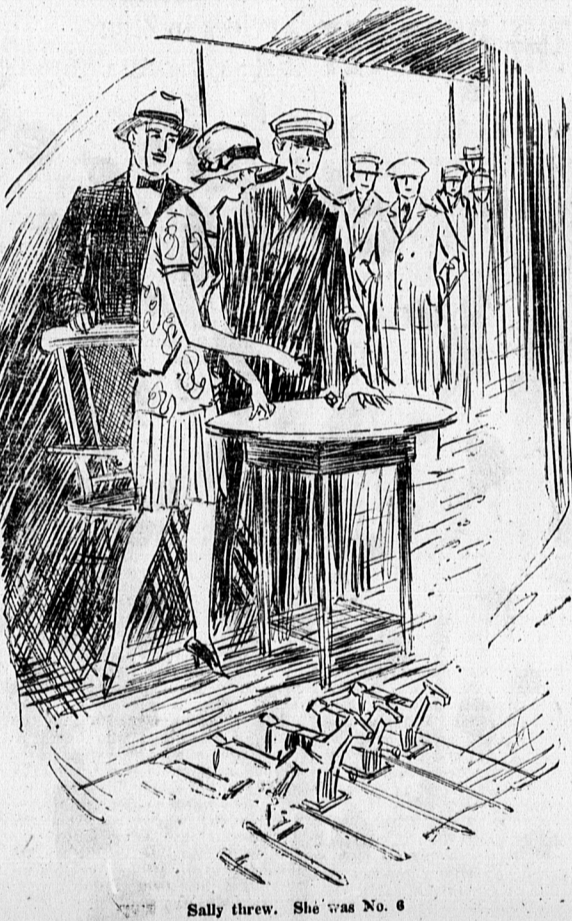
Sally threw. She was No. 6

most over. The next throw of the dice would decide everything. No. 1 moved five, but was too far behind to count. No. 2 moved two. No. 3—No. 3—moved one. The race lay between No. 3 and No. 6. Sally's heart was leaping wildly. "Come on, Sinner, good old Sinner." Again it was her turn to throw, and the die rattled out on the table. Behind her, as if in a dream, she heard the purser's voice: "No. 6 moves four. No. 6 wins! The race is over!" Sally sprang impetuously to her feet. Sinner had won. The green slips she had purchased from the "bookies" dropped from her lap in her excitement. Ritchie and Alden, who had been standing near, retrieved them and handed them to her with a smile. He had watched her from the time the race had started. Those dark