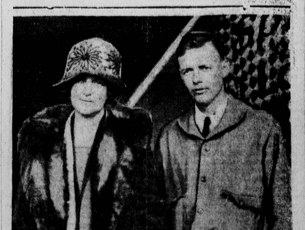
Mrs. Lindbergh and her flying son—Lucky Lindy's "best girl" will bring the flier with her when she comes to Canada to receive life membership in Ontario Education Association at its Toronto convention if present plans mature. Mrs. Lindbergh, shown above with Lindy, will be in Toronto during Easter week.