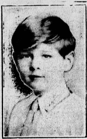
King Michael, boy King of Rumania, finds life "pathetically lonely" in palace at Bucharest. His grandmother's writing a fairy tale for children.