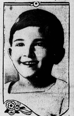
Own Prince Peter of Jugo Slavia, the eldest son of Queen Marie and King Alexander, in a recent pose. Prince Peter is a cousin of King Michael of Rumania, whom he recently met and neglected to salute. The boy king, however, lifted Peter's arm into a saluting position.

MOS CANADA COAL COMES FROM U. S. A. WASHINGTON, March 20.—The United States supplied Canada with 18,314,248 tons, or 95 per cent. of Canada's coal imports in 1927. Trade Commissioner Walter J. Donnelly reported to the Department of Commerce today from Montreal. Of the 15,178,640 tons of bituminous coal brought in during the year, the United States furnished 15,038,008 tons, Great Britain 140,300 tons and Japan 223 tons. The United States was the only source of supply for foreign high-grade coal. During 1927 Canada imported 4,063,619 tons of anthracite. Trade with the United States accounted for approximately 90 per cent. of this business. Riches have wings and travel at a speedier pace. To wash stippled or painted walls make a weak solution of water and a sudless cleaning powder. Go over the walls lightly with a woolen-cloth wrung out of the solution.