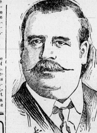
SIR JOSEPH WARD.

Premier Ward then moved a resolution advocating interchange of civil servants. Mr. Harcourt entirely sympathized with the wish for greater knowledge in the dominions of the administrative work at home.