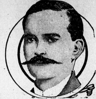
PREMIER JOSEPH FISHER.