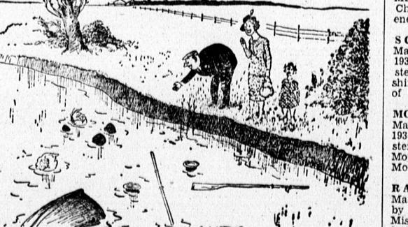
"After all these years! Why, if it isn't Mr. and Mrs. Sprockitt from Romfield!"