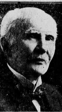
VETERAN CANADIAN JOURNALIST