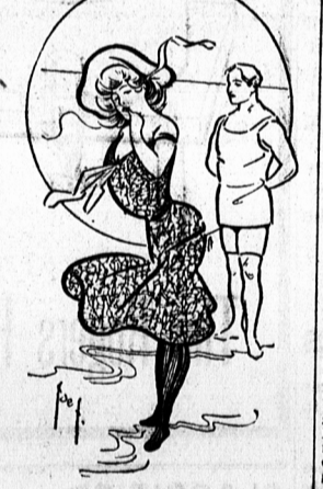
She was wise. He—Ah, sweetheart, I love you more than all my wealth. She—Yes, but you only get ten a week.