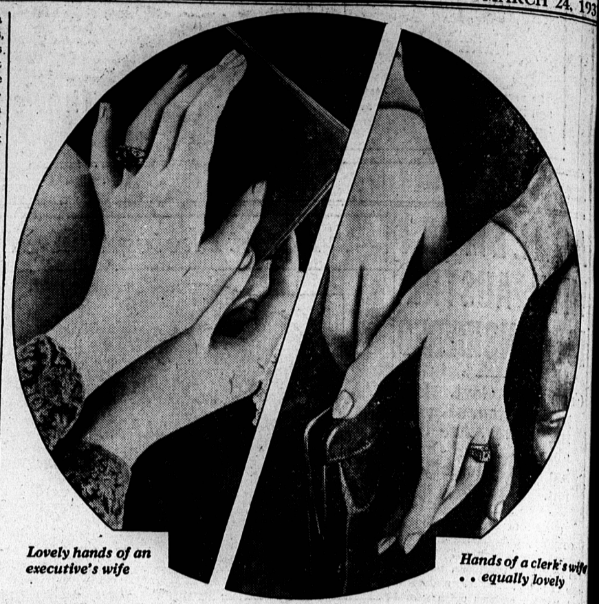
Lovely hands of an executive's wife

"Now we are in the country of the Senecas, brother," said Ta-wan-ne-ars, when we started the next morning. "You have seen the homes of