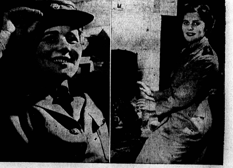
Looking pleased as punch, charming Subaltern Mary Churchill, daughter of Prime Minister Winston Churchill, is shown above wearing the Canadian Women's Army Corps uniform which was presented to her in Britain recently. At left, Miss Churchill, who is a Subaltern in Britain's Auxiliary Territorial Service, tries on the cap. On the right, she models the smart CWAC Summer outfit before a warm fireplace "Somewhere in England".