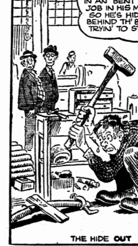
THE HIDE OUT