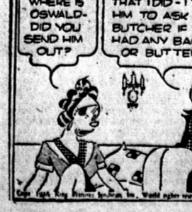
BRINGING UP FATHER