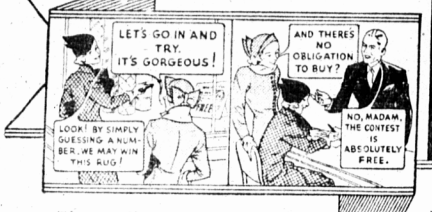
The rug illustrated is "CORONATION" Congoleum Gold Seal Rug No. 426

Hurry up! The Congoleum Gold Seal Lucky Number Contest will definitely close at noon Saturday. If you haven't entered your guess yet—here's all you have to do: