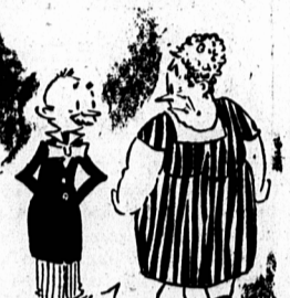
Wife: I ought to dress according to the fashion book, I think. Hubby (sternly): You'll dress according to my cheque book, my dear.