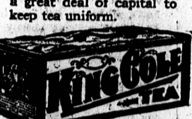
You will enjoy King Cole Coffee too

WE keep, on the average, about a million pounds of tea in reserve. This is necessary because some part of each year's crop is apt to be a failure, and only by piling up tremendous reserves can we be sure of having all the kinds of tea necessary to produce King Cole.