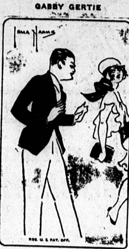
"When a man refuses to attend church any day in the week, he is a Seven Day Absentist."