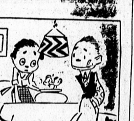
Mrs. Newlywed: What are poached eggs? Mr. Newlywed: Ones that are stolen, I guess.

SEPTEMBER September is here with evenings chill. And lessening length of days; The blossoms fade upon the hill.